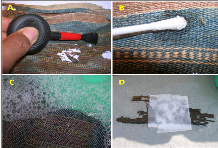
Figure 3: Mechanical cleaning of historical object (A), Testing the stability of dyes (B), Wet cleaning (C), Drying process (D).