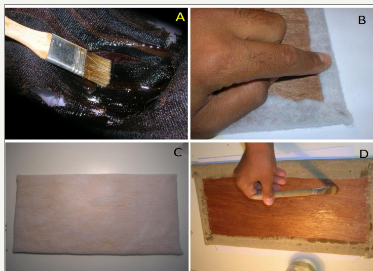
Figure 4: Dry-cleaning of historical object (A), Wooden support was covered by soft textile (B & C), The linen support was attached to the wooden support (D).

In order to prepare the textile for storage and display, it is necessary to provide the fabric with a new support to increase its strength. For this, a carpenter from a nearby village to the location of excavations prepared a wooden support. The wooden support was later coated with Paraloid B72 (10%in acetone) to isolate the wood from the environmental conditions, minimizing thus the movements of the wooden frame. The wooden support was covered by soft textile. Later, a new undyed linen support was prepared and washed to remove any chemical residues from the sizing and finishes, and to prevent shrinkage at a later time due to the humidity changes. After washing and drying, the linen was ironed to remove creases and it was then attached to the wooden support [12,13] (Figure 4).