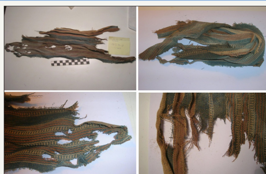
Figure 1: Historical object, one can see damage such as many parts missing in the middle and different type of dirt and stain.