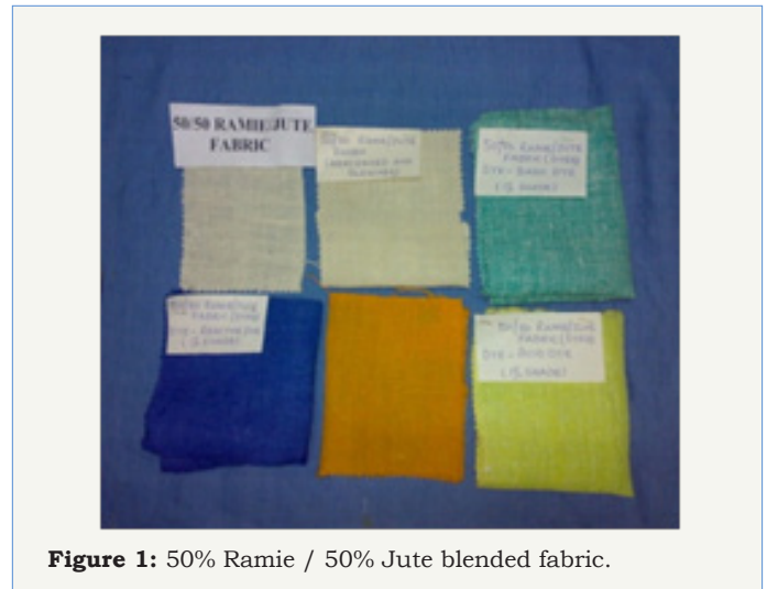
Figure 1: 50% Ramie / 50% Jute blended fabric.

the value added and diversified products using bio-degradable natural fibre. A processing technology has been developed to make blended yarns out of degummed ramie and jute in conventional jute processing system with minor modifications. Incorporation of ramie in the blend with jute indicates that regularity of the blended yarn is better than control jute yarn. The reason may be better fineness of the ramie fibre which provides more number of fibres per unit cross section of the yarn. Control ramie yarn is superior in strength and extensibility than all jute yarn. In the blended yarn with increase in ramie component, the tenacity increases because the filament of ramie is stronger and finer than jute. The tenacity and breaking extension of ramie and ramie blended yarn increases markedly on wetting while the tenacity of all jute yarn decreases on wetting. Hence jute-ramie blended yarn can be used for the manufacture of diversified and value added products replacing jute (Figure 1).