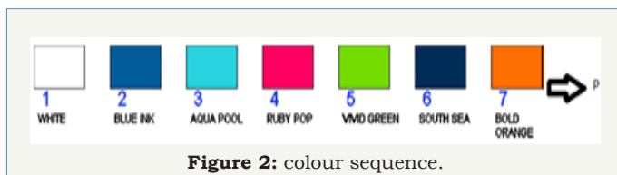
Figure 2: colour sequence.

Suppose, the whole CAD describes only a repeat of 20 inches in the fabric. That means, after making the fabric, the repeat will be 20 inches in fabric. But the CAD itself is not equal to 20 inches in length or width. That time we need to convert the width and length of the CAD for making a perfect warp and weft pattern. By using the CAD, designers will be able to make a perfect warp and weft pattern, color sequence, repeat dwell in the cloth etc (Figure 1 & 2).