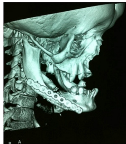
Figure 4: Fracture fixation with the use of 2.4mm, 2.0mm plates and screws and screws post-operative control of the patient, three months after the surgical procedure.