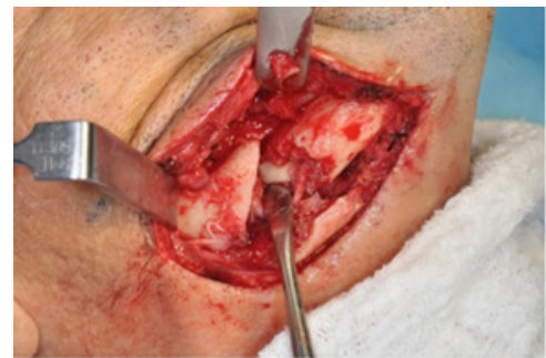
Figure 3: Fracture observed after submandibular access, arrow showing the presence of tooth and inferior alveolar nerve.