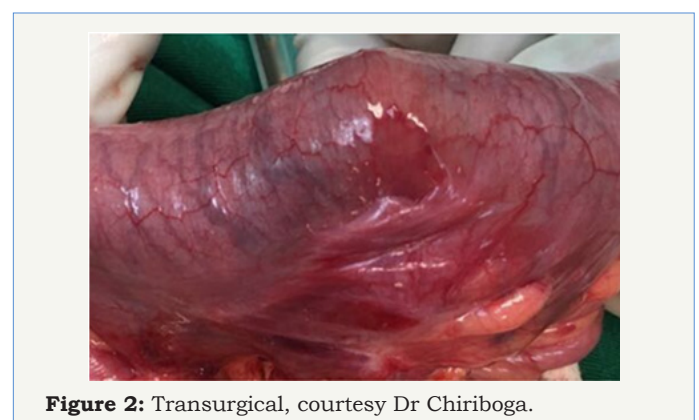
Figure 2: Transsurgical.