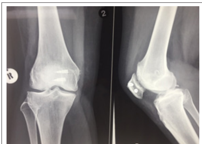
Figure 3: Immediate post-operative x-rays. Reduced patella.

On day 1 post-operative she was unable to extend the knee. For the first 6 weeks post-operative L2 nerve root power was 0/5 on a five-point scale, with significant wasting of quadriceps at 6 weeks. There was gradually improvement of power to 3/5 at 3 months follow-up. Electromyography (EMG) done at 4 months revealed chronic axonal femoral neuropathy on the right at the level of the tourniquet. The findings were consistent with both compressive and subsequent ischemia of the nerve. There was no electrophysiological evidence of a lumbosacral plexopathy/radiculopathy. Side-to-side comparison of femoral motor response revealed an approximate 25% axonal loss on the right with no electrophysiological evidence of an on-going demyelinating lesion at the inguinal ligament. At 9 months post-operative the power was 4.5/5. At 1 year follow-up the power was 5/5 and comparable to the left side.