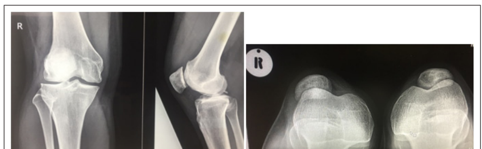
Figure 1: Pre-operative x-rays (Shows lateral sublimed right patella).

A 29 year-old teacher, presented with a history of recurrent instability of the right patella. The first episode occurred post fall during gym exercises and the patella shifted outwards. This was reduced by the gym instructor and she was subsequently put on a patella knee brace by the general practitioner. After removal of the brace she had multiple recurrent falls with the patella dislocating laterally and was unable to do exercises without a brace. Clinically there was effusion on the knee with positive grinding test. The 'J sign' was positive. X-rays showed laterally subluxed right patella as shown on the skyline view as shown in Figure 1. The TT -TG was 16mm with no trochlear dysplasia and with Insall Salvati ratio of 0.75 with normal alignment of the right lower limb. MRI revealed complete tear of MPFL (Figure 2). We therefore proceeded to do isolated MPFL reconstruction with Gracilis tendon autograft under spinal anaesthesia and tourniquet was inflated to 300mmHg for 115 minutes (See Figure 3). The average Blood pressure was 118/68 intraoperatively. The operation was uneventfully.