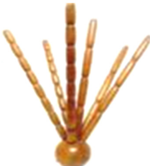
Figure 2: The wavy ray model.