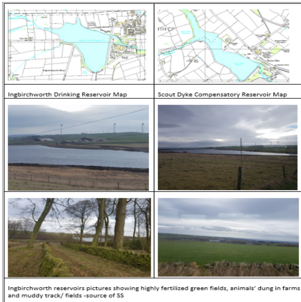
Figure 2: Maps and Pictures Ingbirchworth reservoirs taken during site visit.

and some of the cultivated crop lands. This area is being managed by catchment sensitive farming under policies of DEFRA, Nitrate Vulnerable Zones legislation and Catchment Sensitive Farming advice since 2002. Pictorial coverage/ maps of reservoir are given in Figure 2.