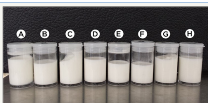
Figure 1: Appearance of canola-based emulsions prepared with 3 or 5% (w/v) surfactants Tween® 60 (A, C, E, and G) or Tween® 85 (B, D, F, and H).