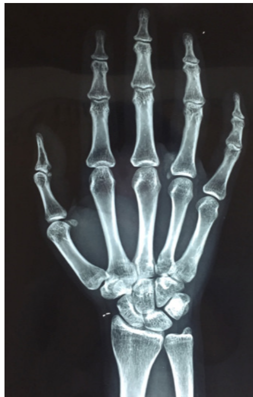
Figure 1: X-ray of the hand showed calcification over the volar aspect of the 4th metacarpophalangeal joint.

Copyright@ Rana Terlemez. Michaels, This article is distributed under the terms of the Creative Commons Attribution 4.0 International License, which permits unrestricted use and redistribution provided that the original author and source are credited.