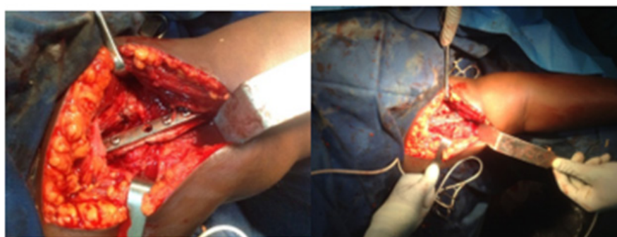
Figure 1: Osteomuscular decortication followed by iliac graft in a 33-year-old patient.

The study included 50 patients (37 men and 13 women). The mean age of the series was 41.6 years (range 22 and 75 years). There were 31 (62%) cases of non-union of the right humerus versus 19 (38%) non-union of the left humerus. The middle third of the right humerus was the most affected. The most frequent fracture lines were oblique (49%) and transverse (32.7%). The causes of fractures complicated by non-union were road accidents in 36 cases (72%), firearms in 5 cases (10%). The initial management of fractures before the onset of pseudarthrosis was carried out in 7 cases (14%) by bonesetter consultants and 43 (86%) by doctors. The initial treatment was orthopedic in 21 cases (42%), surgical in 20 cases (40%) and traditional in 9 cases (18%). Iliac graft was used in 15 cases. A patient with septic nonunion consolidated without infection after stabilization with an external fixator. All the patients consolidated (p = 0.000). The mean time to union was 17.2 weeks (range: 10 and 22). The postoperative functional results according to the Stewart and Hundley score compared to the preoperative ones were very good in 35 cases (70%), good in 13 cases (26%) and quite good in 2 cases (4%) (P = 0.0000) (95% CI: 5.108-243.8) (Figure 1 ; Tables 1-3).