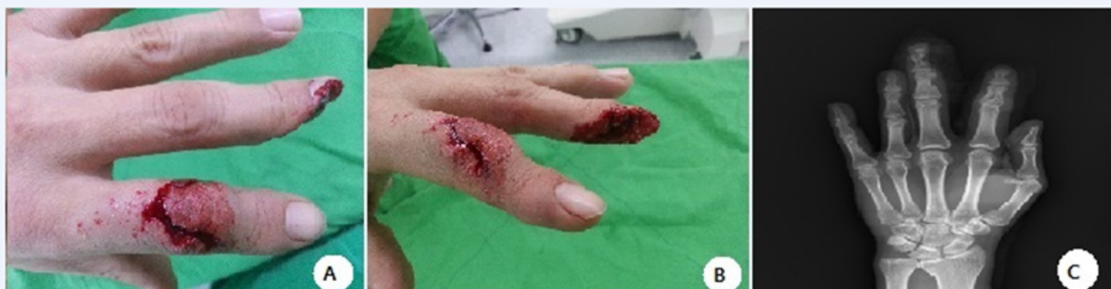
Figure 1: Initial amputation injury to the distal phalanx of the middle finger. The distal phalanx is obliquely amputated with a minimal portion of the nail remaining. The tendon attachments are preserved. (A and B) Preoperative clinical images, and (C) Radiograph.