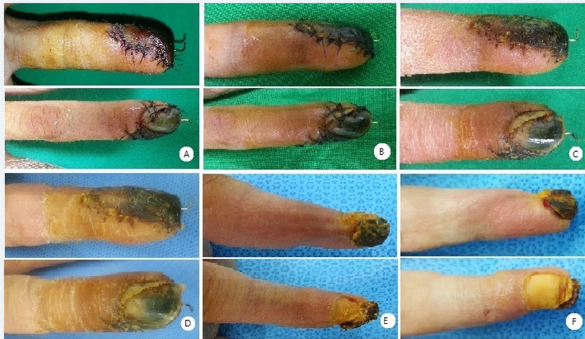
Figure 2: At one-week postoperatively, the middle finger began mummification appearance distal to the attachment. Prostaglandin-E1 (PGE-1) assisted conservative treatment has demonstrated wound healing, and the necrotic tissue was substituted by regenerated vital tissue. (A) Observation at one week, (B) three weeks, (C) five weeks, (D) eight weeks, (E) six months, and (F) eleven months, postoperatively.

onto the stump. Distal phalanx fracture was internally fixated with a K-wire. Culture study revealed no active infection. Needle puncture to the fingertip showed negative capillary perfusion. PGE-1 of Alprostadil was daily administered intravenously (Eglandin; Mitsubishi Tanabe Pharma Co., Osaka, Japan) 10µg/day for one week followed by the oral tablet of Limaprost intake (Opalmon, 10µg tid). The tissue presented mummification appearance since postoperative one week (Figure 2).