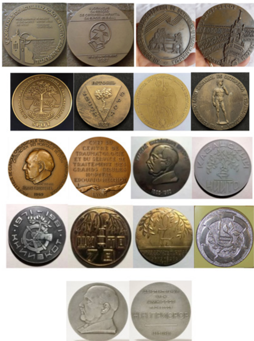
Figure 3: Thematic numismatic collection dedicated to traumatology and orthopedics and a number of their heroes.

Further, in Figure 4, a small philocartical selection of thematic postcards and poster cards is presented, from different years of their release and dedicated to different events and different people involved in issues of traumatology and orthopaedics [102-115]. This completes another research article, thematically devoted to orthopaedics and traumatology, using screenshot copies of