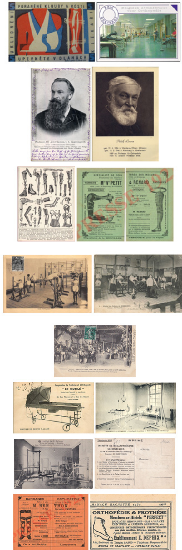
Figure 4: Philocartic selection dedicated to orthopedics and traumatology.s