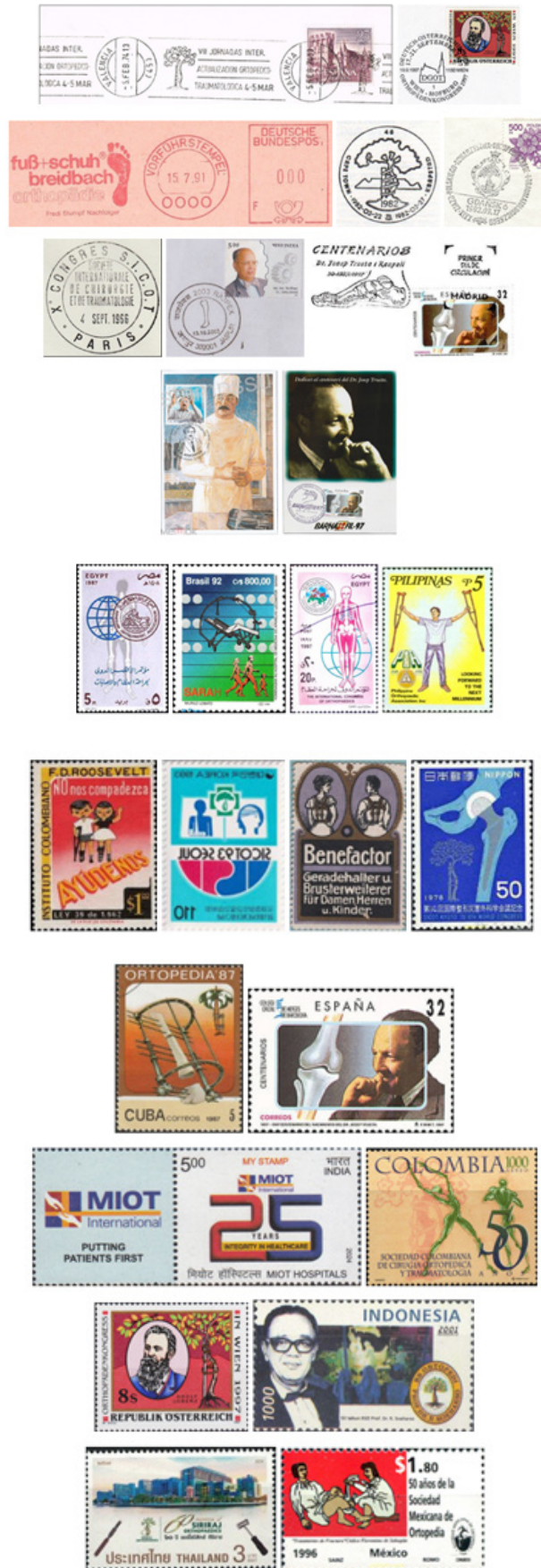
Figure 2: Philatelic collection, thematically dedicated to traumatology, orthopedics and a number of their heroes.