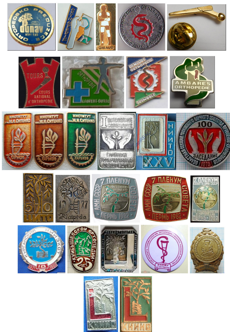
Figure 1: Thematic phaleristic collection dedicated to traumatology and orthopedics.

materials are presented in thematic Figure 1 [2-8]. Further, in Figure 2, a thematic, philatelic selection is presented, dedicated to traumatology and orthopaedics, their history and a number of heroes, both scientists and practicing doctors, issued in different years, in different countries of the world [9-74]. These are postage stamps, first day postage covers and artistic stamped envelopes, maximum cards, postal blocks, special cancellation postmarks of such countries of the world as the Russian Federation, Spain, Portugal, Austria, Egypt, India, Japan, Philippines, Indonesia, Cuba, Brazil, Germany, the People's Republic of China (PRC) [11-74]. Further, in Figure 3, a thematic numismatic selection of collectible materials (commemorative table medals and commemorative coins) is presented, from different countries of the world, including the former USSR, and from different years of their issue, made of different metals and/or their alloys, thematically dedicated to orthopaedics and traumatology and a number of practicing doctors, famous in their countries. In most cases, these commemorative medals and coins are presented from both sides-obverse and reverse [75-101].