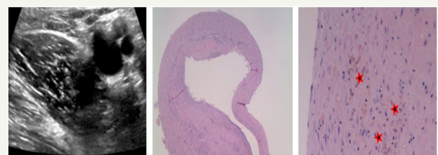
Figure 1: Ultrasound image (left) of the groin bulge demonstrates a heterogeneous fluid collection in close proximity to the cord vessels . Microscopic pathology under low power (middle) showing the pseudocyst cavity on cross section. A lumen is visualized with a uniform wall of at least 1mm circumferentially. High power (right) of the cyst wall does not identify a specific cell lining; it demonstrates mild acute and chronic inflammation, with hemosiderin-laden macrophages labeled by the stars.

reported in the literature (Figure 1). The patient recovered well with resolution of pain at postoperative follow up.