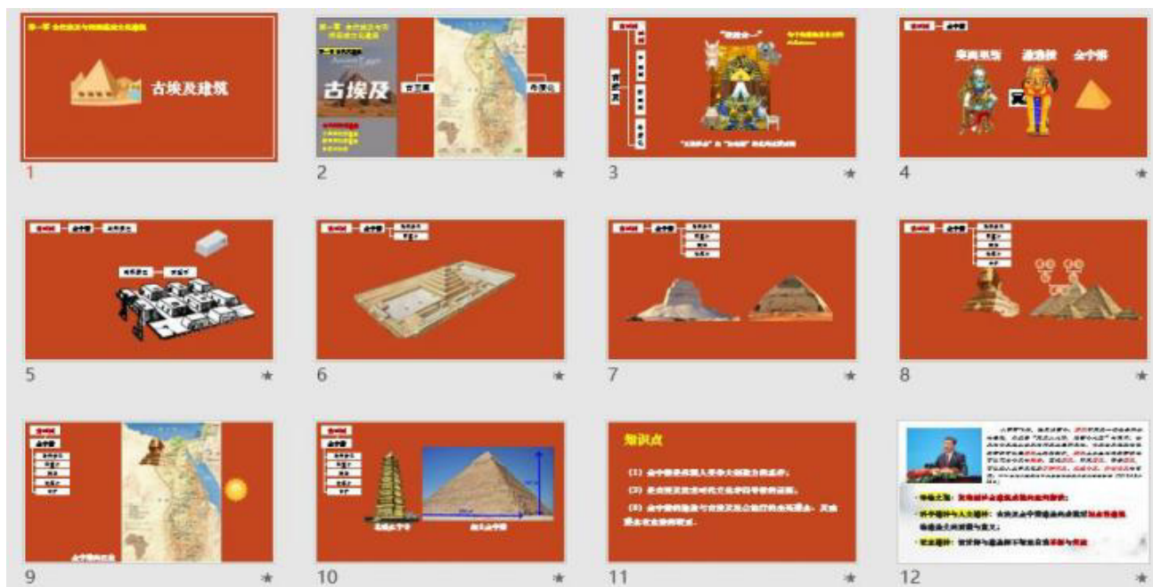
Figure 2: Teaching resource development: An example of online learning resources collaborated by teachers and students (Ancient Egyptian Architecture).

Establish cooperative relationships with local architecture-related enterprises and cultural heritage protection units, integrate resources through course-specific research projects, provide students with opportunities for course practice and future internships, and enable students to achieve a fusion of theory and practice in the course, thereby improving their comprehensive abilities and future employment competitiveness.