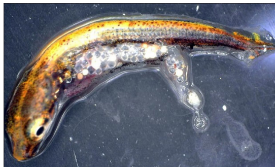
Figure 2: Plastic nanoparticles accumulated in pelagic fish used for fish meal in this way are plastic nanoparticles entering our food chain.

"food" for human consumption. This fish meal is usually made from cheap pelagic fish such as herring and anchovy fish (Figure 2).