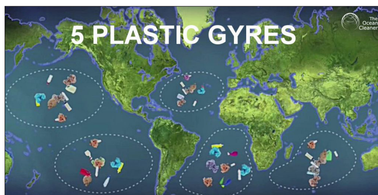
Figure 1: Plastic waste accumulating in our five ocean gyre systems including the very ecological productive Humboldt Current eastern gyre ecosystem production chamber of mostly pelagic fish species like sardines, anchovies and jack mackerel which are processed in the fish meal industry in this way contaminating our feed- casu quo food-chain with plastic and plastic nano-particles.