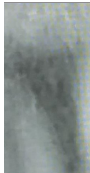
Figure 6: Geminated / Double tooth completely calcified root canals.