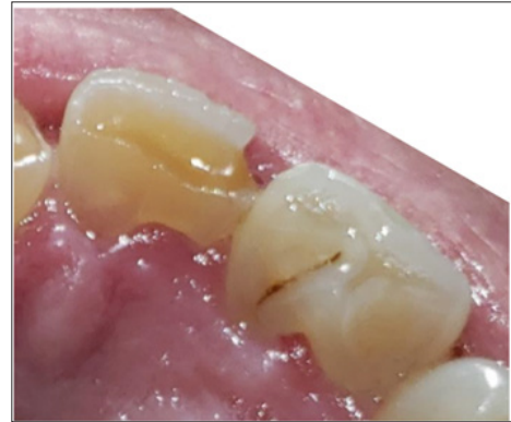
Figure 5: Linguo-incisal view geminated / double tooth # 10 heavy attrition on incisal edge / fracture on Disto-Facio-Linguo-Incisal (DFLI) of tooth # 09.