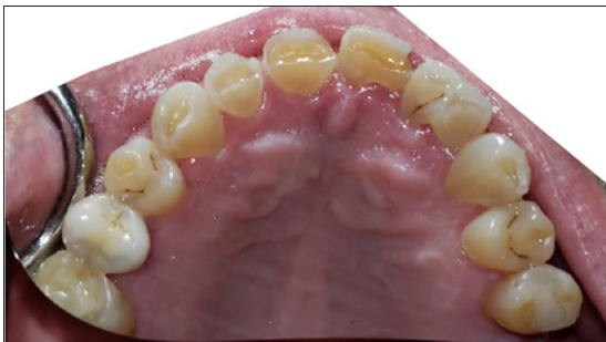
Figure 3: Maxillary occlusal view heavy attrition on incisal edges of anterior teeth oversized/abnormally shaped of geminated tooth # 10.