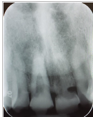
Figure 7: Teeth #s 08 & 09 radiographic evidence of external / internal root resorptions & partially calcified root canal.