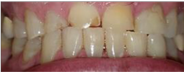
Figure 2: Facial / Labial view oversized crown of geminated tooth # 10 end to end incisal contacts with chipped incisal edges of anterior teeth.