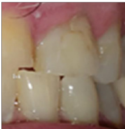
Figure 4: Facial / Labial view oversized/abnormally shaped geminated tooth # 10.