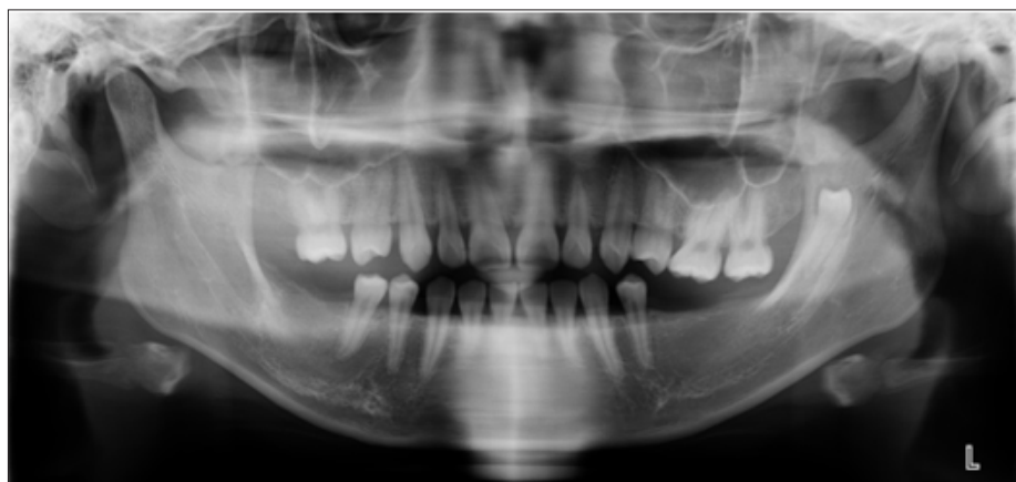
Figure 1: Panoramic radiograph showing the transmigrated left 2 nd Premolar in the ramus.