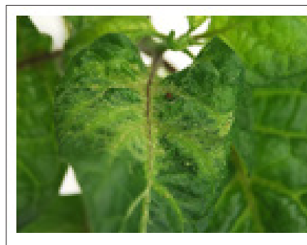
Figure 13: EDEMA.

EDEMA is water retention disorder caused by more water uptake by the plants through rooting system then the water can be used or evaporated through leaves (Figure 13).