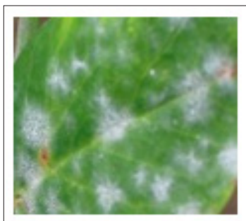
Figure 11: Powdery mildew.

Powdery mildew is the most commonly found mildew and are host specific, mildew that can infest chilli will not to other crops (Figure 11). PM growth can be characterised by the white cobweb type mycelium on the upper surface of the foliage and sometimes on other parts (stems, buds, flowers, and pods) as well. When humidity becomes very high in the summer, this fungus attacks the plant leaves, especially at the flowering and fruiting stage. The fungus only takes its nutrition from upper cells and doesn't damage the inner tissues. It can affect the crop size very badly and looks like white powdery spots on leaves as its name depicts. Optimum temperature for Powdery mildews is between 60-80 °F.