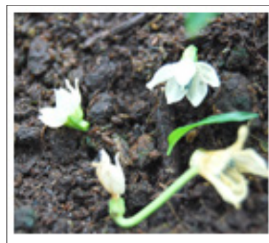
Figure 14: Flower drop.

Flower drop is a very common problem faced by all the chilli growers (Figure 14). The most common reason behind the flower dropping is lack of pollination due to indoor plant growth, airflow is another common cause which hinders the natural pollination. Unstable temperatures, overfeeding, application of water more than the desired amount and delayed fruit harvesting can promote flower drop. Timely fruit harvest can encourage the new flowers to develop pods, and plant could use its energy to develop new fruits instead of maintaining the older ones.