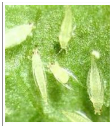
Figure 3: Thrips.

Thrips are minute insects, individually so small in size that they can pass unnoticed, but breath taking when in clusters (Figure 3). Out of 5000 thrips species; only few 100s invade cultivated crops. Especially, Scirtothrips dorsalis Hood attacks chilli crop to greater level. Besides Pakistan thrips has also been reported from Japan, Australia, Thailand, SriLanka, West Malaya New Guinea, Java and Solomon Island. Thrips penetrate in the chilli plant tissues by using piercing mouth parts. Adults and nymphs especially infest soft leaves and feed on sap. Thrips attack depicts a typical leaf curl virus developing into a boat like shape. However, under acute infestation, leaves become brittle, stunted plant growth, malformed tender shoots, buds and blossoms