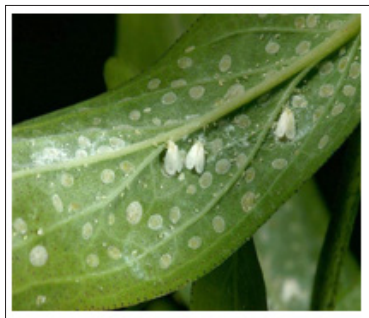
Figure 1: Whitefly.

Whitefly (aleyrodidae) is soft bodied insect with wings similar to aphids (Figure 1). They inhabit