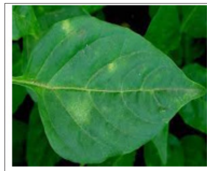
Figure 12: Downy mildew.

Downy mildew is rare but very damaging and characterized as yellow, light green or dark spots on the upper surfaces of the leaves (Figure 12). Unlike powdery mildew they are different organisms related to algae. With the disease progress foliage turn brown and dropping off. In the affected discoloured areas, a downy gray or brownish masses may appear on the underside of the foliage. Preferred temperature for downy mildews ranges between 50-75 °F. To control this disease, resistant varieties may be preferred, affected plants may be removed and demolished. Moreover, removal of affected plant debris that may accommodate pathogens. In severe conditions drastic measures may be adopted control the spread of the disease and crop loses.