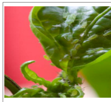
Figure 2: Aphids (green plant lice).

solution stimulates sooty mould growth, in turn leaves become black. Natural ways to control the aphid infestation is by attracting natural predators like lady birds, crab spider and hoverfly.