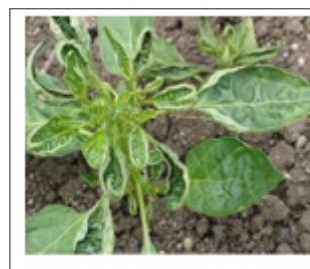
Figure 8: Whitefly.

This viral disease is caused by the whitefly, aphids, thrips and mites (Figure 8). Affected plants are characterized by the stunted growth with curling and yellowing foliage. The leaves become boat shape due to decreased size and upward curling of the leaves. All the infected plants should be removed from the field. Spray suitable insecticide to control the aphids.