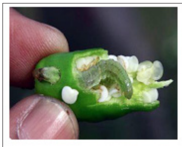
Figure 4: Helicoverpa armigera (Heliothis).