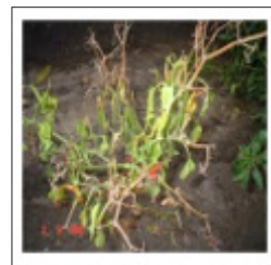
Figure 7: Chilli Leaf Curl.

plantation seed should be treated with Trichoderma viride @10g/kg (plant wise) to get rid of this problem biologically. Biocontrol agents ( Trichoderma ) should be saved from the chemical spray.