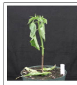
Figure 9: Phytophthora Blight.

The disease is distinguished by dark brown patches on stem, expanding upward from the soil line followed by an abrupt wilt of the whole plant without yellowing of leaves (Figure 9). The root and collar-rot disease is of great significance in different parts of the world including Pakistan [10,11], can be controlled by planting chillies on ridges for better drainage than on furrows (Baris et al. 1986). It can be managed by crop rotation, use of resistant cultivars and application of fungicides [12]. Irrigation should be applied carefully to lessen the disease proliferation; water should be lower than the base. Additionally, avoiding cultivation of pathogen prone crops (brinjal, bean, tomato and cucurbits) may also help in controlling the disease.