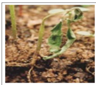
Figure 5: Damping-off: Disease caused by Pythium aphanidermatum .

This disease caused by Pythium aphanidermatum (Edson) is destructive to young seedlings, especially decaying the stems near the soil base (Figure 5). It causes 90% of plant death either pre or post-emergence attack both in nursery and in the field [8,9]. Generally damping off can be overcome by planting the treated seeds in 4-6 inches apart in well-drained beds.