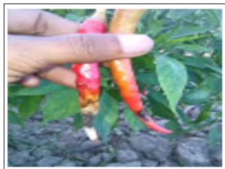
Figure 15: Blossom end rot.

This is an environmental and physiological issue mainly caused by the calcium deficiency, over or sporadic watering (Figure 15). These issues can be interconnected uneven water disturbs calcium uptake and results into blossom end rot.