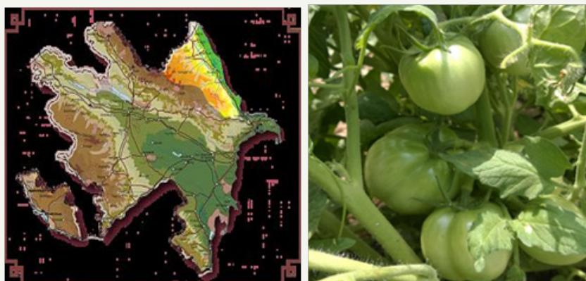
Figure 1: The weight and diameter of the tomato fruit has also increased.

Compared to the results of the observations, the amount of nitrogen given as an ingredient in the background (10t /ha) + N 0 P 90 K 90 , compared with the control variant, increased by 12.2cm or 20.6%, and was 71.5cm. The weight and diameter of the tomato fruit has also increased, and there are no adverse effects in biochemical parameters (Figure 1). Also, the removal of fertilizers to the norm (10t/ha)+N 90 P 90 K 90 from the control (fertilized) variant did not result in excessive accumulation of excess nitrogen, phosphorus and potassium in the tomato plant.