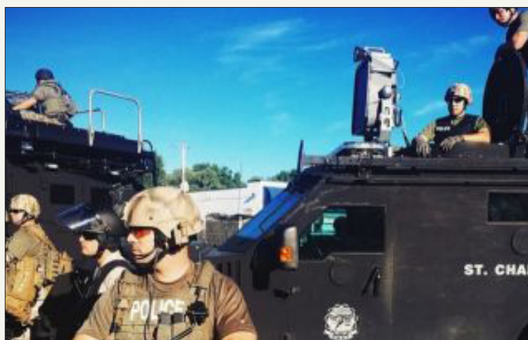
Figure 1: The LRAD Infra-sound cannon mounted to a vehicle.