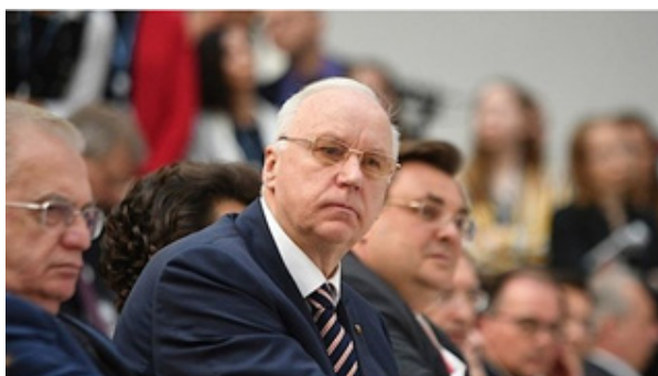
Figure 1: General alexander bastrykin, the head of russia's investigative committee (a sort of super attorney general)

With cloud seeding a program such as this, it's a huge benefit to some companies, but that additional water also makes problems for the municipality, for agriculture, and more and more problems for consumption and life of inhabitants. So not everybody is benefiting. But there are concerns about cloud seeding's long-term impacts. For example, it's unclear how making it rain in one village affects a neighboring village, cities, etc. It's also up for debate who "owns" the water -- such as which state or company -- that comes out of the clouds [35]. There are also environmental questions, such as ones related to the long-term impacts of silver iodide. Although some critics may have concerns about companies impacting the weather, the company disputes that it's "playing God" [4,5].