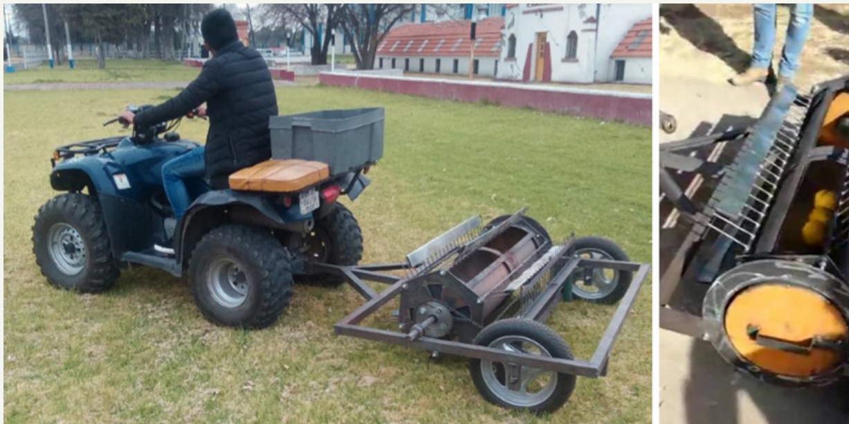
Figure 2: Fruit picker in the back of the cuatrimotor showing some fruits inside the cylinder.