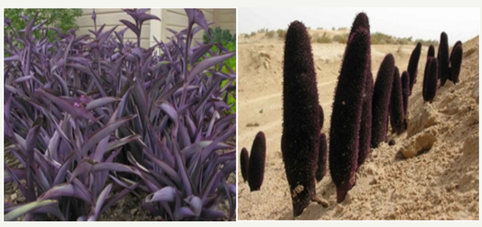
Figure 1: Photos of Tradescantia pallida purpurea and Cynomorium coccineum grown throughout the region of Monastir, Tunisia.

pallida purpurea gives a pH dependent color. It is red at pH_3 and yellow at pH 8. However, the resulted dye from Cynomorium coccineum is blue (Figure 2).