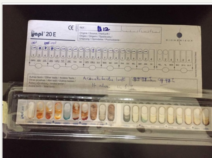
Plate 1: API kit and typical result of one of the bacterial isolates (Viz: Acinetobacter lwoffii ).

Klebsiella oxytoca and Escherichia coli were least in occurrence with value of 4.55% each. This also corroborates the findings of [17], who studied the potential of Pseudomonas sp. , Bacillus sp. , and Proteus sp. isolated from rivers polluted by hydrocarbons and refinery effluents to degrade petroleum [18]. The result of this investigation showed the occurrence of high numbers of certain oil degrading microorganisms from oil polluted environment as evidence that these microorganisms are the active degraders of such environment [19]. The majority of these organisms isolated were Pseudomonas aeruginosa , Bacillus spp , Micrococcus luteus and Acinetobacter lwoffii and the dominance of these organisms has been reported by different researchers as crude oil degraders [5].