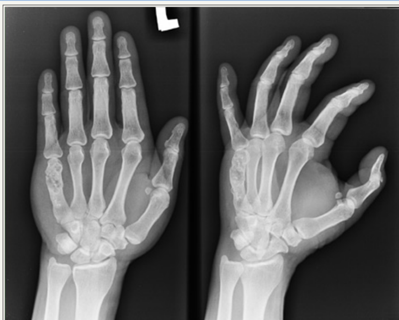
Figure 1: Left hand x ray findings: lesion over proximal 5 th metacarpal.

Radiograph of the left hand showed expansile sclerotic lesion over distal 3 rd of 5 th metacarpal with cortical destruction and increased soft tissue shadow, but no periosteal reaction. Magnetic resonance imaging (MRI) scan was done showed thinning cortex and endosteal scalloping of infection over distal aspect of 5 th metacarpal with measurement of 0.3.5 x 1.1 x 1.5cm (AP x W x CC). The rest of bones show normal marrow signal. The visualized hand muscle and neurovascular bundle were normal. Computer Tomography Thoracic Abdomen Pelvis (CT TAP) revealed no evidence of metastasis elsewhere in the body (Figure 1).