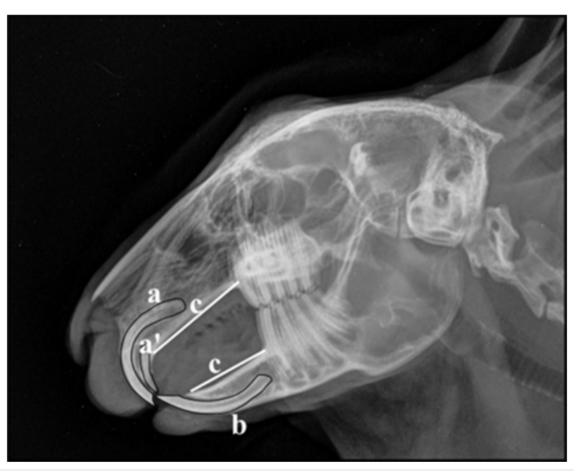
Figure 2: Radiograph of a rabbit head in latero-lateral projection: first incisor of the maxilla (a); second incisor of the maxilla (a'); incisor of the mandible (b) and diastema (c).