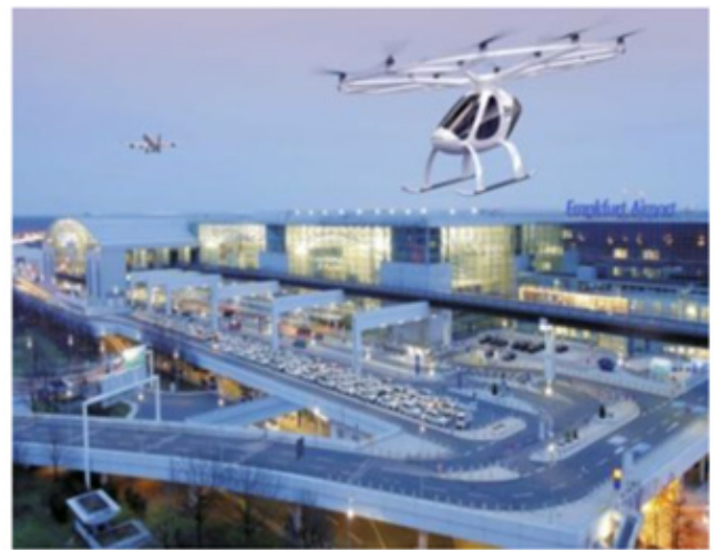
Figure 12: German aerial unmanned taxi.