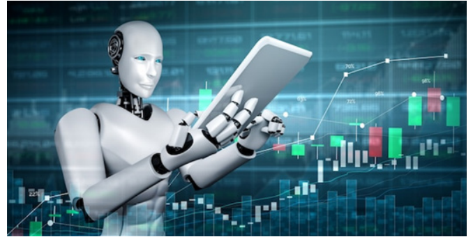
Figure 11: Korean multimodal robot analytic.