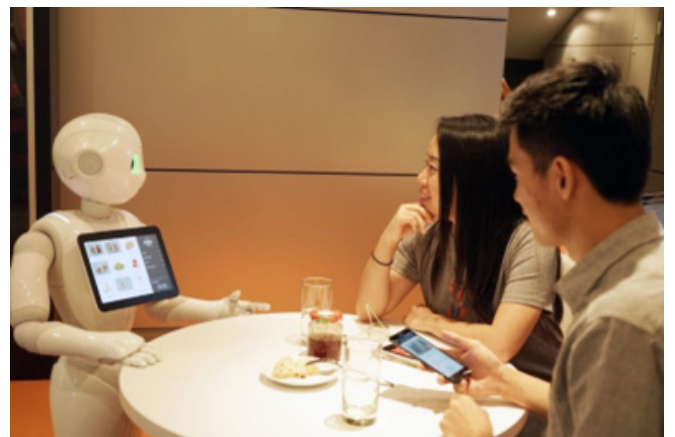
Figure 13: Singapore robot waiter.