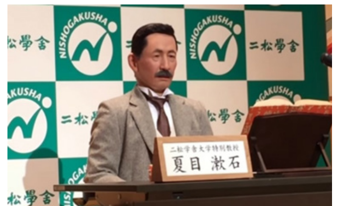
Figure 8: Japanese robot lecturer on literature.