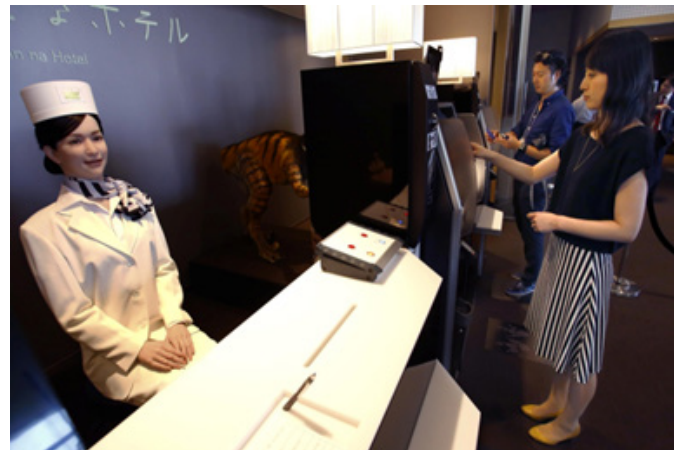
Figure 7: Japanese robot-administrator of hotel Henn-na Hotel.