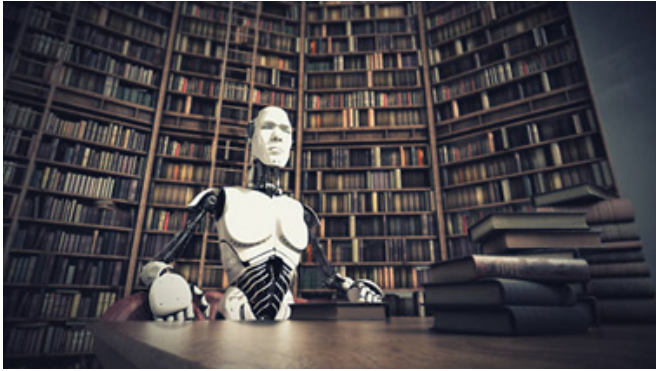
Figure 3: Chine library robot.

(Figure 12) transports passengers along the air corridor; Singapore robot waiter (Figure 13) humanoid robot Pepper takes orders and processes accounts for Pizza Hut customers in Singapore using the global electronic payment service Master Pass, Russian car without a driver (Figure 14) transports passengers along a given route, multimodal generative intelligent robot (Figure 15) communicates cognitively with people and conducts dialogue.