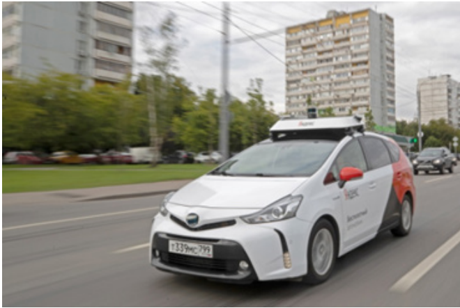
Figure 14: Russian car without a driver.