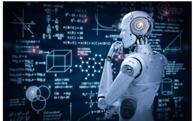
Figure 1: Intelligent robot with Technological thinking and spectroscopic vision.