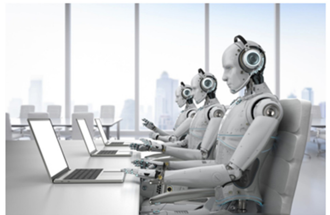
Figure 2: Human-Robot Communication.

Standardization of intelligent systems helps to securely use them in many industries and services. Intelligent robots are used in various countries as librarians, hotel administrators, tour guides, salespeople, lecturers and other social service providers. Intelligent multimodal robot with technological thinking and spectroscopic vision (Figure 1), multimodal humanoid communication robots can work in many areas of activity and serve many clients (Figure 2), China library robot (Figure 3) and Indian library robot (Figure 4) and American intellectual library system for issuing books (Figure 5) serve visitors and fulfill their orders, Russian library robot guide (Figure 6) introduces visitors to paintings by various artists, Japanese robot-administrator of hotel Henn-na Hotel (Figure 7) checks visitors into rooms by number, Japanese robot lecturer (Figure 8) teaches students, European smart cleaning robots (Figure 9) picks up trash on the street, Iranian intelligent communication robot Surena 4 (Figure 10) recognizes and tracks faces and objects, generates full body movements, and recognizes and synthesizes speech and dialogue, Korean multimodal robot analytic (Figure 11) audits business companies, German aerial unmanned taxi