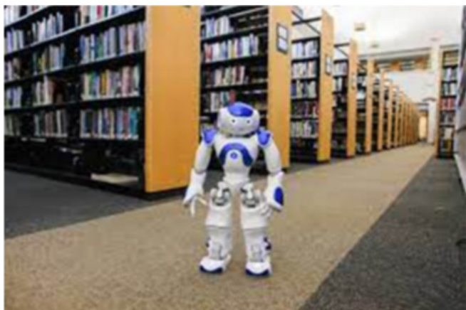
Figure 4: Indian library robot.