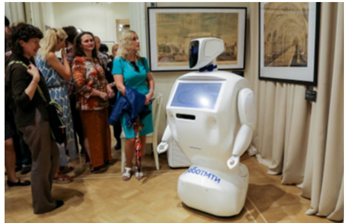
Figure 6: Russian library robot guide.