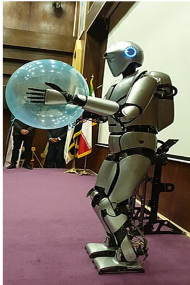
Figure 10: Iranian intelligent communication robot Surena 4.