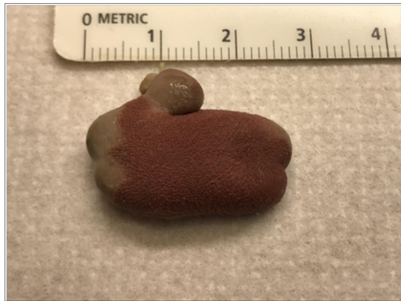
Figure 1: Hairy Polyp

Copyright@ George R Wettach. This article is distributed under the terms of the Creative Commons Attribution 4.0 International License, which permits unrestricted use and redistribution provided that the original author and source are credited.