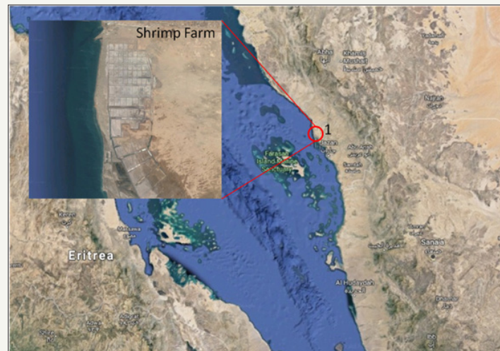
Figure 1: Location of the sample collection site Jazan, Saudi Arabia. 1. 17°15'11.2"N 42°20'52.5"E

The samples used in the present study were obtained from moribund shrimps ( Fenneropenaeus indicus and Litopenaeus vannamei ) cultured in Jazan region, Saudi Arabia during epizootics in October, 2014 and August 2015 (Figure 1). The moribund shrimps were collected and dissected the pleopods at the farm site and fixed samples were transported to Fisheries Research Center, Jeddah, and it was stored in -80 °C for the downstream application [10,11].