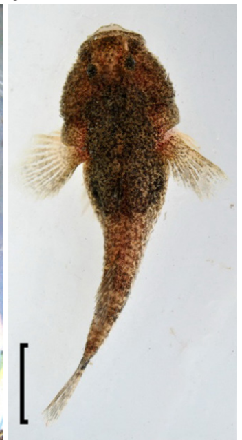
e): Benthophilus durrelli .