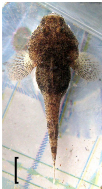
d): Benthophilus nudus .