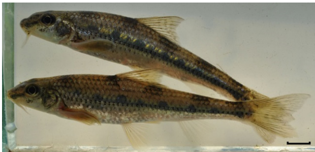
a): Romanogobio kesslerii .

Note: “-” - species not found; “+” - species found (Abundance: + - rare, ++ - common, +++ - dominant); “?” – species reported by fishermen to be present, but have not been detected in our catches.