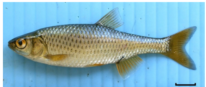
b): Petroleuciscus borysthenticus .