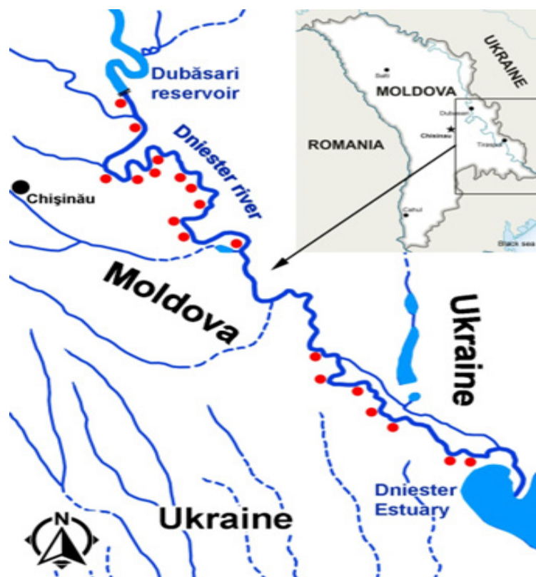
Figure 1: Map showing the geographical location of sampling area.

into consideration. Fish were caught by expeditionary methods using various fish-rods, a fry dragnet (6.0-10.0mm mesh size, 1.5-2.0m height, 5.0-10.0m length), the gillnets (mesh size of 12 to 50mm, 1.8m height, 30m length), the fyke-nets, as well as float and bottom fishing rods. Working methods and techniques generally accepted in ichthyology and ecology as well as surveys of anglers were used. For the species and age determinations, the following sources were used [9-14]. The following categories have been chosen for quantitative assessment of the values of fish occurrence: + rare species (separate specimens of the fish were observed during the entire period of studies), ++ common and +++ dominant species (more than 100 and more specimens for a year of studies).