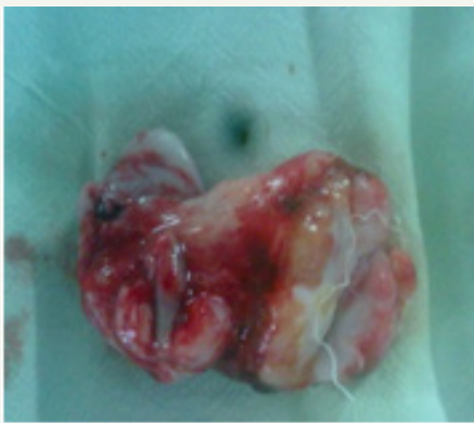
Figure 2: Intraoperative Specimen of nasopharyngeal mass.

The plan of endoscopic excision of mass under general anesthesia was made. Mucosal decongestion achieved with nasal puffs and 1:10000 (4% Xylocaine and adrenalin solution). Previous finding of endoscopy confirmed. Mass was attached to posterior edge of nasal septum and the postero-superior portion of the right side nasal septum. Incision taken on posterior bony portion of right side of septum. Septal flap elevated on right side over bony septum, bony attachment of mass cauterized with bipolar cautery and mass delivered into per orally. Hemostasis achieved and nasal packing done. The resected mass was not encapsulated but relatively circumscribed. The cut surface of the mass was pale, gray-white, solid and homogeneous (Figure 2). Histological examination of the mass revealed Encapsulated mass showed combined proliferation of eosinophilic, thin, wavy collagen fibres lying in a disorderly pattern and spindle-shaped cells with a wavy, serpentine configuration and pointed ends and the spindle-shaped tumour cells.