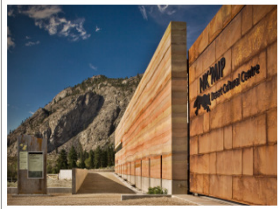
Figure 1: Cultural center building in earth.

my mind that a high-rise building consisting of glass, steel and concrete, and a shiny city filled with those skyscrapers in high density. If so, is it the goal that dismissed the megalopolis and its populations, insisting dugout hut, adobe buildings, like rewinding movie film? I know, it is nonsense. In the fields of architecture and construction, a significant level of effort on environmental factors had been focused on improving energy efficiency of buildings, still built in accustomed fashion of modern architecture. It seems, in a manner, just like sticking to unhealthy lifestyle and dietary only by substituting soda for orange juice, ignoring critical symptoms of serious illness. In fact, it is time to require radical change in entire lifestyle and dietary with painful effort of controlling ourselves, moreover, quite deal of self-sacrifice.