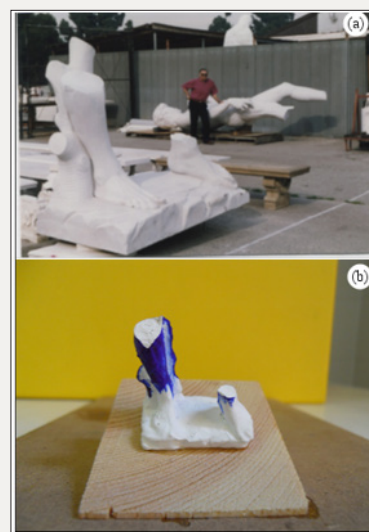
Figure 1: a) The Glendale David after the Northridge earthquake. b) the David replica crushed in the Corti et al. [3] experiment.

likely after carving [7]. Despite this support, the reversal stresses originated by the Northridge earthquake damaged the replica David's statue [7]. The collapse of the statue was driven by stresses induced by ground shaking that caused fractures at the left ankle and right knee, closely resembling those observed in a small-scale David centrifugal test [3] (Figure 1).