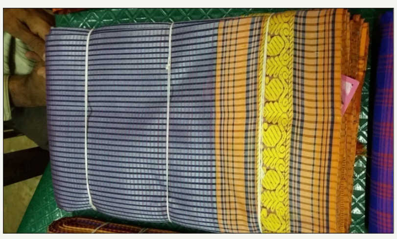
Figure 2 : Koorai nadu sarees with colour variations.

The Koorai Nadu sarees consisted of simple checks and only few colours were used for traditional designs and patterns were as easily available. The major customer for this saree was from Mysore. When there was demand for silk and the import of silks from China slowly reduced, weavers started buying silk from Mysore. At one point of time the silk merchants started buying the woven saree from the weavers and failed to pay them back. This led to decline of the Koorai Nadu saree and it totally vanished from the traditional list of sarees of Tamil Nadu.