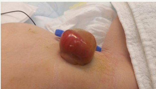
Figure 1: 3 x 2,5 x 4 cm size minor omphalocele through which a segment of bowel is clearly visible.