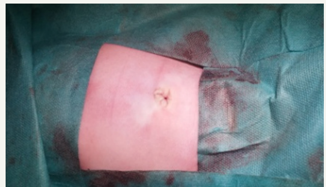
Figure 3: The neo-umbilicus.

the resected tissue confirmed a Meckel's diverticulum with locally active inflammation.