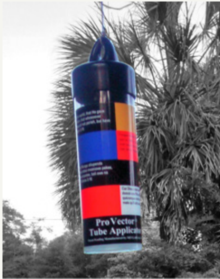
Figure 1: The ProVector® Tube Applicator uses different colors to attract different mosquito species, which feed through holes in the bottom of the tube on an attractant bait, protecting non-target species such as bees and butterflies and reducing pesticide in the environment.

other mosquito-borne diseases. In a study conducted by the Walter Reed Army Institute of Research in Kenya, the ProVector Flower with Entobac (Bti only) was tested against adult mosquitoes. Seven housing compounds with no applicators were included as controls in the study area. After one month, there was a significant reduction of medically important mosquitoes in all nine compounds with the ProVector Flower compared to two of seven control compounds (Chi-square=11.5, p < 0.05 ) [3]. The ProVector Flower has an open face and must be used either indoors or hung in a way to protect it from rain. The ProVector Tube was developed to be used either indoors or outdoors. The colors on these devices are important as they attract different types of species and where a device is used to control medically important mosquitoes, one should have flexibility (Figure 3).