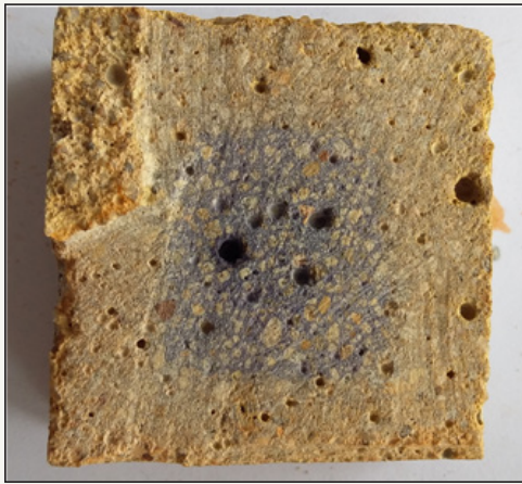
Figure 1 : Example of the carbonation front measured by using the blue timol indicator solution. The easiest and most widely carbonation model used in mortars and concretes is shown in Eq. (1).