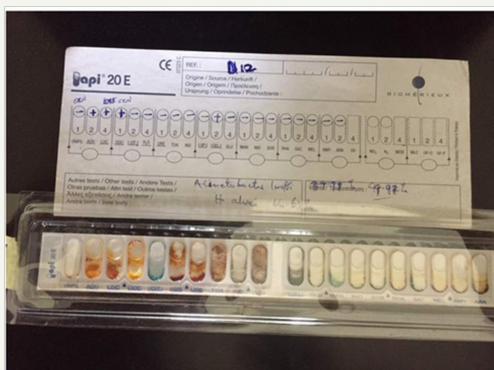
Plate 1: API kit and typical result of one of the bacterial isolates (Viz: Acinetobacter lwoffii ).

Klebsiella oxytoca and Escherichia coli were least in occurrence with value of 4.55% each. This also corroborates the findings of [17], who studied the potential of Pseudomonas sp. , Bacillus sp. , and Proteus sp. isolated from rivers polluted by hydrocarbons and refinery effluents to degrade petroleum [18]. The result of this investigation showed the occurrence of high numbers of certain oil degrading microorganisms from oil polluted environment as evidence that these microorganisms are the active degraders of such environment [19]. The majority of these organisms isolated were Pseudomonas aeruginosa , Bacillus spp , Micrococcus luteus and Acinetobacter lwoffii and the dominance of these organisms has been reported by different researchers as crude oil degraders [5].