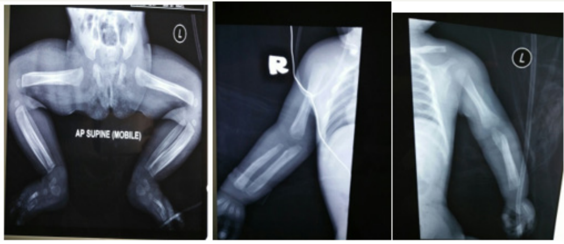
Figure 1: Cortical hyperostosis over long bones.

cortical hyperostosis was made after ruling out other causes. Oral indomethacin for symptom control was suggested, but the parents declined. Child was subjected to conservative treatment.