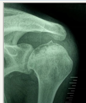
Figure 1: True anterior-posterior (AP) view in case 1: subchondral sclerosis and radiolucent area in humeral head.

Clinical evaluation: Clinical examinations showed right shoulder muscular atrophy. In all range of motions, including flexion, abduction, rotation limitation and pain on was remarkable.