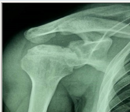
Figure 3: True anterior-posterior (AP) view in case 2: the subchondral sclerosis and radiolucent area in humeral head.

Clinical evaluation: Clinical examinations showed left shoulder muscular atrophy. In all range of motions, including flexion, abduction, rotation limitation and pain on was remarkable. Also, tenderness was noted in lumbar spine examination.