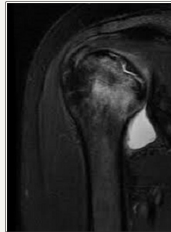
Figure 4: MRI view in case 2: the avascular necrosis of humeral head.

Radiographic evaluation: Standard radiological diagnoses include conventional x-ray images. True anterior-posterior (AP) view (Figure 3) revealed subchondral sclerosis and a radiolucent area in humeral head. Also, there were some degenerative changes in the articular surface of humeral head. MRI determined the avascular necrosis of humeral head (Figure 4).