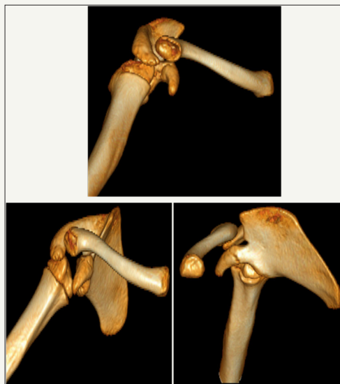
Figure 1: Computed tomography with 3D reconstruction of the shoulder of a 9-year-old patient with sequela of obstetric palsy. The elongated coracoid process is observed and projected onto the humeral head, which is posterior displaced.

further towards the scapular line and the humeral head (Figure 1). Nath et al concluded, through tomographic measurements, that there are statistically significant differences in the size of the coracoid and its distance to the humeral head between the normal sides and affected by obstetric paralysis [3]. This alteration in the coracoid process can limit the elevation of the limb by the impact of this elongated structure against the humeral head, besides interfering in the surgical treatment, in those cases in which there is a need to relocate the humeral head.