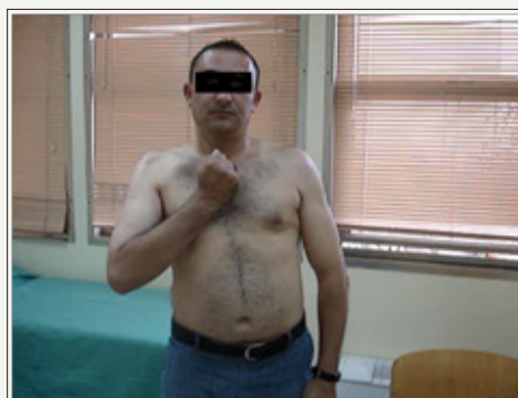
Figure 4: post-operative result.

We report one sensory deficits in the median nerve area, it was a woman 24-year-old. The deficit in the median nerve was hypoesthesia of the first three fingers who recovered after 05 weeks.