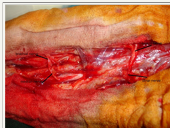
Figure 2: left; suture of the ulnar nerve with The nerve of the biceps, right; suture of the median nerve with the brachial nerve

For the shoulder palsy, we associated with the double transfer, a transfer of the accessory spinal nerve to the suprascapular nerve in only one case, in a girl 8 years old. for the other patients we associated a C5 root graft on the first trunk, if the C5 root was not avulsed.