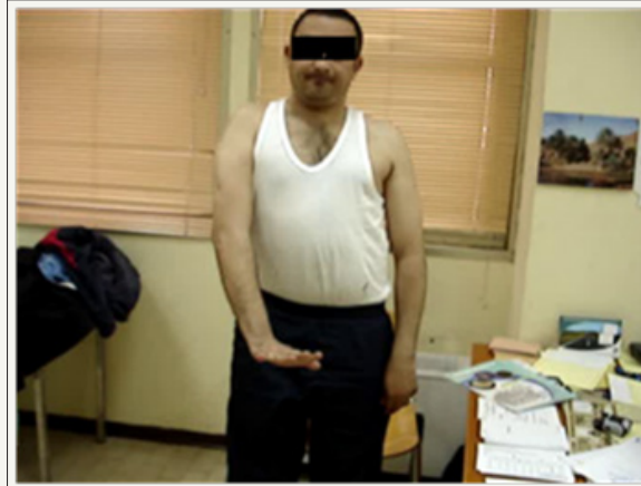
Figure 3: preoperative C5-C6 Brachial plexus palsy.