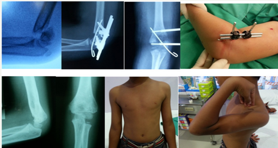
Figure 2: This patient with supracondylar humeral fracture is treated with lateral external fixation and Kirschner wire insertion. He subsequently recovers well with good cosmetic and functional outcomes.

Thirty out of 31 patients who underwent lateral external fixation for supracondylar humeral fractures had achieved good functional range of movement and all 31 of them had excellent cosmetic results [12]. Case series published by Kow et al. [17] also reported good cosmetic and functional outcomes in all but one of their patients. Lateral external fixation offers a more superior biomechanical stability than the pinning method in flexion, extension, internal and external rotations [18]. Patients who have had lateral external fixation do not require post-operative back slab protection as a contrary to those undergoing pinning due to its more stable construction. Therefore, lateral external fixation will be