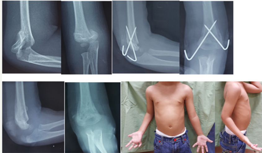
Figure 1: A supracondylar humeral fracture which is fixed with cross Kirschner wires. The fixation is unsuccessful due to the rotational instability. The patient subsequently developed limited range of movement and loss of carrying angle of the right elbow. The patient also developed ulnar nerve injury secondary to the insertion of the medial Kirschner wire.

and distal Shanz pins can be utilized as joysticks to achieve a good reduction [16]. Alternatively, another temporary Shanz pin can be placed distal to the deltoid insertion site to facilitate the rotational reduction prior to correction of sagittal and coronal planes using the proximal and distal Shanz pins [17].