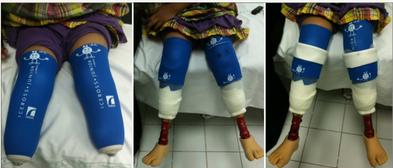
Figure 2 : show the first patient during her follow up.