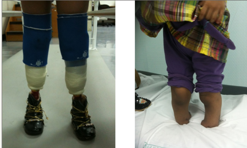
Figure 3 : show the first patient during standing with end weight bearing with and without wearing the prosthesis.

With no bony overgrowth although follow up is short we are not expecting bony overgrowth even with long follow up.