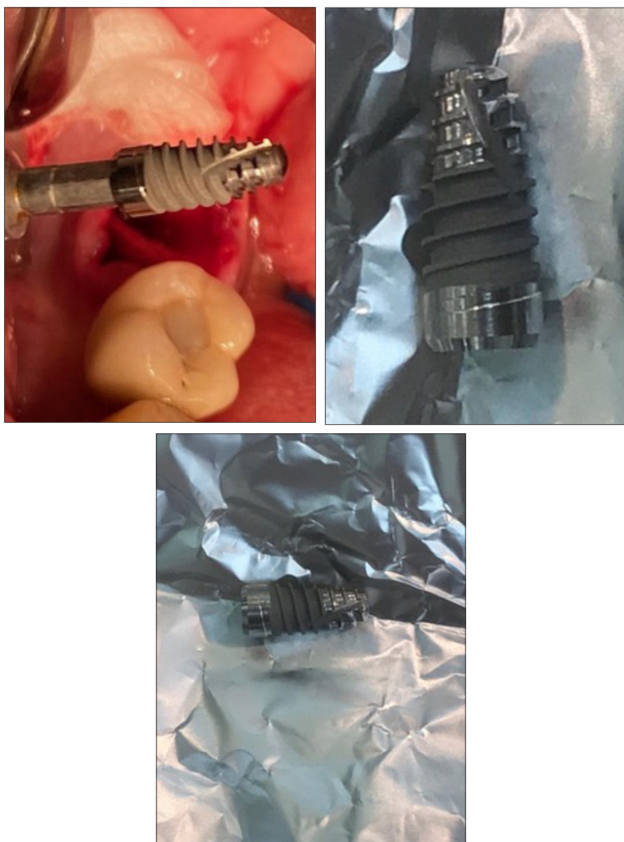
Figure 1: A prototype of a 3-hybrid implant with surfaces dedicated to 3 different tissue compartments. Additionally, implant coated with double covalent layer of hyaluronic acid and its geometry modified with vertical groove to shred more bone chips during insertion.

The risk of rough surface to form biofilm has already been indicated in 1993 by Dennis P Tarnow [7] who already then suggested a hybrid implant with a machined titanium surface in the coronal half and a rough titanium surface in the apical half. 'This will theoretically allow for minimal plaque accumulation at the crest if the implant becomes exposed to the oral environment'. Tarnow's idea for hybrid implants have become materialised after 25 years by Massimo Simion [8] who has also demonstrated that the rough surface is not any better forming bone than 'old' machined surface (Figure 1).