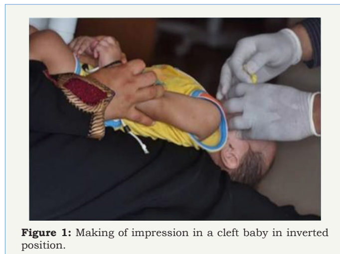
Figure 1: Making of impression in a cleft baby in inverted position.

A heavy-bodied impression material is used to take the initial impression as soon after birth as possible [10]. Impression is taken with the infant in the lap of the guardian in an inverted position (Figure 1). Once the impression material is set, the tray is removed and the mouth is examined for residual impression material that may be left behind. A cast or model of the alveolar anatomy is made by filling the impression with a dense plaster material (dental stone). The molding plate is fabricated on the dental stone model. It is made of hard clear acrylic and lined with a thin coat of soft denture material. Care is taken to reduce the border of the plate in the labial frenum attachments and other areas that may be likely to