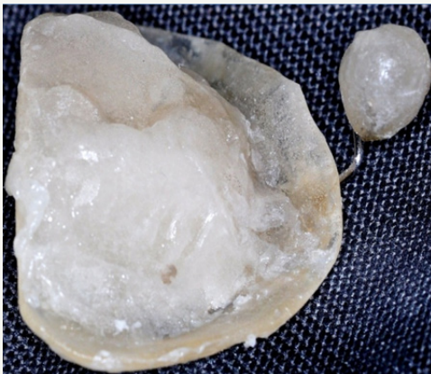
Figure 6: Relined NAM plate.

The alveolar segments should be directed to its final and optimal position. Care must be taken to prevent the soft denture material from building up on the height of the alveolar crest as this will prevent complete seating of the moulding plate.