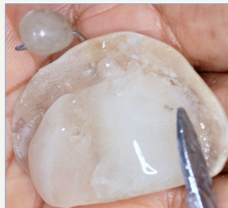
Figure 5: Addition of soft tissue liner.

The baby is seen weekly to adjust the moulding plate to bring the alveolar segments together. These adjustments are made by selectively removing the hard acrylic and adding the soft denture base material to the moulding plate. No more than 1mm of modification of the moulding plate should be made at one visit (Figure 5 & 6).