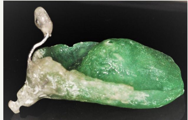
Figure 4: NAM plate with nasal stent added.

cleft lip segments. The tape should be applied at the base of the nose (nasolabial angle) and not low on the lip near the vermilion border. The tape should be applied to the noncleft side first, then pulled over and adhered to the cleft side, trying to bring the philtrum and columella to the midline.