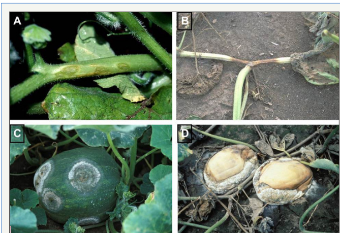
Figure 1: Pumpkin vines and fruit infected by Phytophthora capsici .