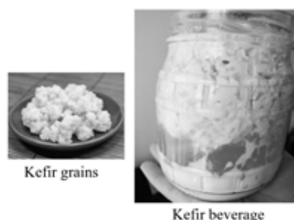
Figure 1: Kefir-grains and beverage.

Kefir is a fermented milk product having slight acidic taste, carbonation, and aroma good. The kefir beverage contains a specific mixture of microorganisms (lactic bacteria, acetic bacteria e yeast) that reside in symbiotic manner in a kefir polysaccharide matrix. Kefir grains (Figure 1) can be characterized as small cauliflower florets, having a length of 10-40mm, irregularly shaped, white to yellowish in color, having firm texture and slimy appearance. The kefir microorganisms have a capacity to produce organic acids, antibiotics, and numerous types of antimicrobials; these substances have a lethal effect on pathogenic microorganisms of the body. Kefiran is an exopolysachhardie component of kefir grain that has significant importance in human health and nutrition [1,2].