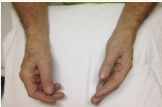
Figure 1: Physical examination comparing wrists and hands, demonstrating pronounced edema in the right wrist.

A 69 years old man with right wrist pain and functional limitations for 06 months. Finkelstein, Tinel and Phalen tests were negative. Important edema in the wrist and hand at physical examination (Figure 1). Ultrasonography demonstrated pseudoaneurysm with thrombosis in the distal radial artery (Figures 2 & 3).