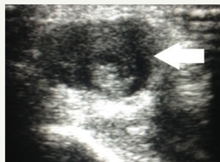
Figure 2: Ultrasonography without Doppler demonstrating thrombosis in the distal radial artery (white arrow).

A 69 years old man with right wrist pain and functional limitations for 06 months. Finkelstein, Tineland Phalantests were negative. Important edema in the wrist and hand at physical examination (Figure 1). Ultrasonography demonstrated pseudoaneurysm with thrombosis in the distal radial artery (Figures 2 & 3).