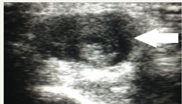
Figure 2: Ultrasonography without Doppler demonstrating thrombosis in the distal radial artery (white arrow).

A 69 years old man with right wrist pain and functional limitations for 06 months. Finkelstein, Tinel and Phalen tests were negative. Important edema in the wrist and hand at physical examination (Figure 1). Ultrasonography demonstrated pseudoaneurysm with thrombosis in the distal radial artery (Figures 2 & 3).