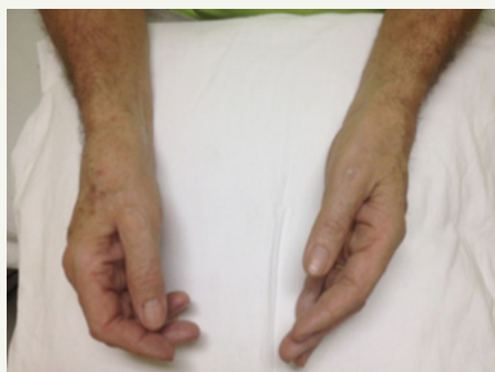
Figure 1: Physical examination comparing wrists and hands, demonstrating pronounced right edema.

A 69 years old man with right wrist pain and functional limitations for 06 months. Finkelstein, Tineland Phalantests were negative. Important edema in the wrist and hand at physical examination (Figure 1). Ultrasonography demonstrated pseudoaneurysm with thrombosis in the distal radial artery (Figures 2 & 3).